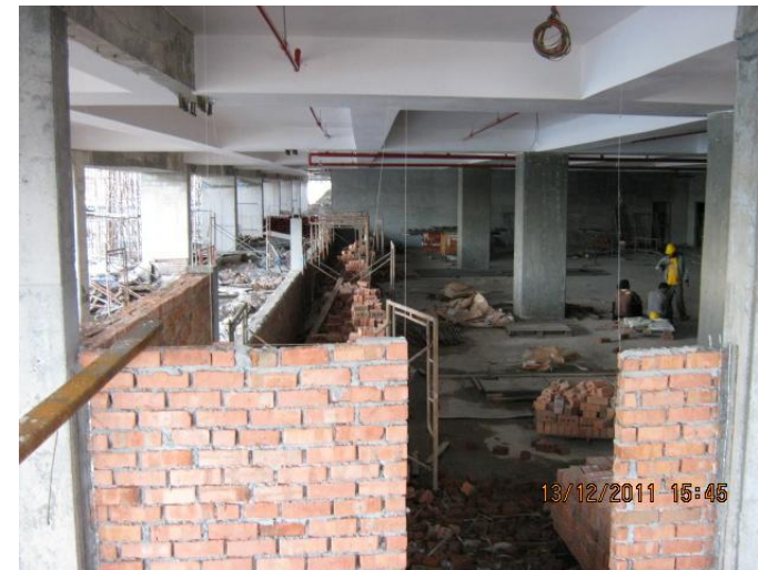
Constructing Brick Wall