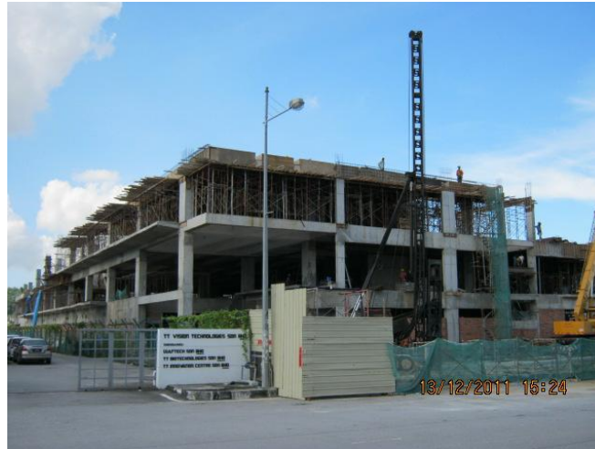
Left view: completed at level 3