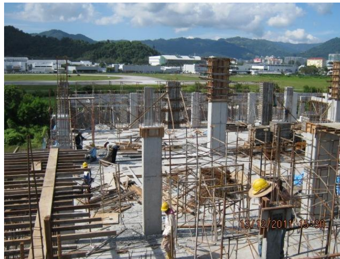
Scaffolding support for level 4