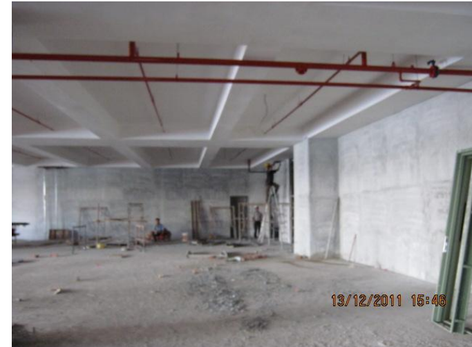
Completed Level 1 Skimcoat.